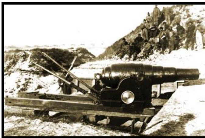
The Fort Fisher Armstrong gun

Jim McKee will share with our membership the story of the heavy guns that were placed in the numerous fortifications that the Confederates occupied to protect the Cape Fear region. Jim will provide details about the many types of guns and where they were acquired.