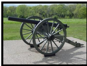
12 pdr. Whitworth Breechloading Rifle