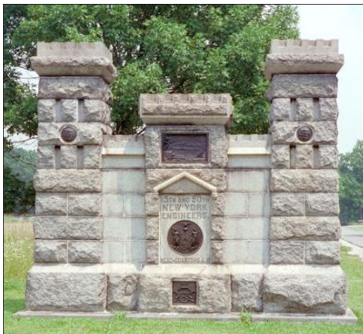
15 th & 50 th New York Engineers Monument at Gettysburg