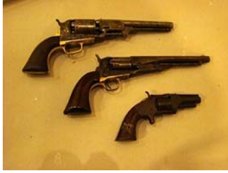
Colt Dragoon, Colt 1860, Smith & Wesson

The journey must have been interesting for Dobey and Jimmy will continue their journey in Dog Soldier Moon .