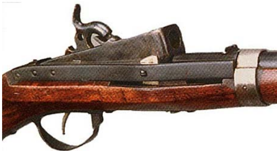
Hall Breech loader – Harpers Ferry Armory

2 - What was the first breech-loading infantry long arm to be manufactured for use by the United States Army? Inventor John H. Hall patented the breech-loading long arm in May 1811. This flintlock weapon, later updated to percussion lock in 1833, took either cartridge or loose ammunition. A lever in front of the trigger guard was pulled to the rear; hence, a short section of the barrel was pivoted upward enough to load the weapon. The breech was then closed for firing. In 1819, Hall reached a royalty agreement with the government to produce the weapon at the Harpers Ferry Armory. The Hall breech loader was the first weapon made with interchangeable parts and was produced at Harpers Ferry until 1844. Approximately 200,000 of these weapons were manufactured over their gradual adoption period. Reluctant acceptance by many field officers in opposition to recommendations from ordnance experts, limited the effective development and utilization of this innovative weapon. By the beginning of the Civil War, many Ordnance Bureau officers (including Ordnance Chief James W. Ripley who replaced Henry Knox Craig in mid-1861) were opposed to the introduction of large numbers of breechloaders and repeating rifles into the Union Army. NOTE: Carl L. Davis provided an interesting study of the breechloader controversy in his Arming the Union: Small Arms in the Civil War .