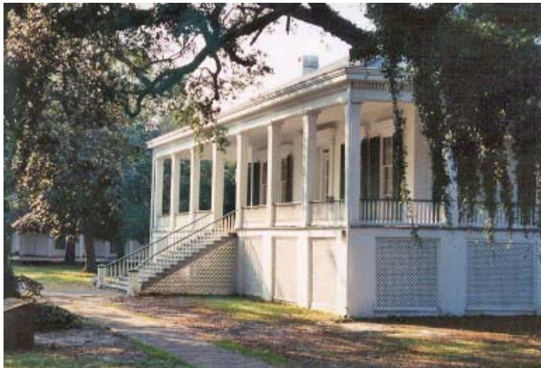
Beauvoir – Home of Davis, Biloxi Prior to Hurricane Katrina 2005